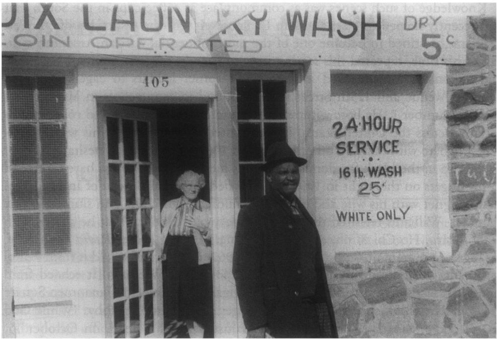
Unidentified African American man in front of a “white only” laundromat, Monroe, North Carolina, 1961. In the South where Robert F. Williams grew up, black maids washed the bodies of aged and infirm white people, but the uniforms that they wore could not be laundered in the same machines that white people used.